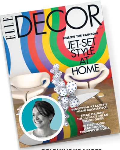
Paris-born creator of exuberant and playful spaces. as seen on the cover of ED's May 2019 issue.